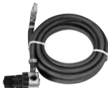
KIT 445-2 Regulator and Hose with Quick Disconnect Plug