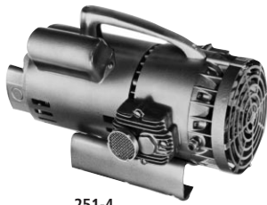
251-4 Air Compressor