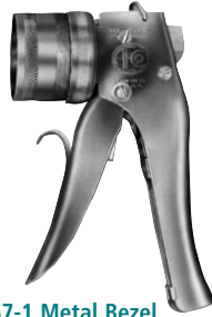
467-1 Metal Bezel

Compact. Lightweight carriageless units produce less wrist strain.