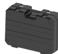
Optional Hard Plastic Carry Case for AT-Line Guns (1001-1)