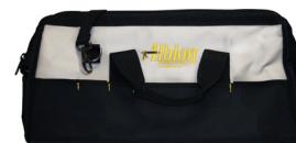
Optional Tool Bag (968-3)