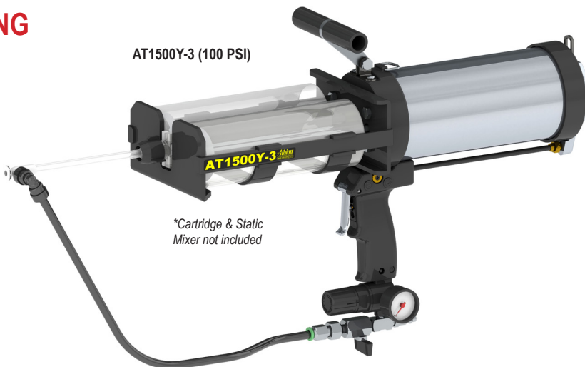
AT1500Y-3 (100 PSI)