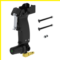
Trigger / regulator replacement handle. Quick & inexpensive. #957-11