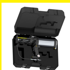
Protective, hard plastic, carry case. Fits all AT1500 guns. #1001-1