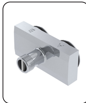
LARGER MANIFOLD EASY TO CLEAN