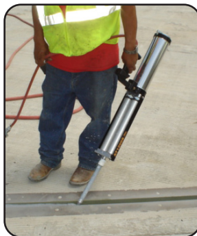
ONE HAND CONTROL