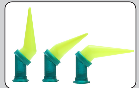
360° SWIVEL ACTION