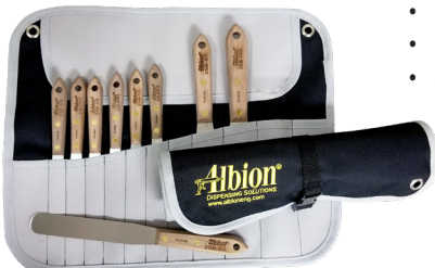
9-Piece Classic Spatula Set in Tool Wrap (258-G01)