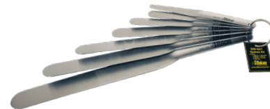
7-Piece Streamline Caulk Spatula Set (958-G01)