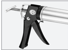
Special Deluxe Drive