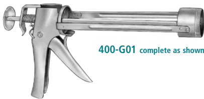
400-G01 complete as shown