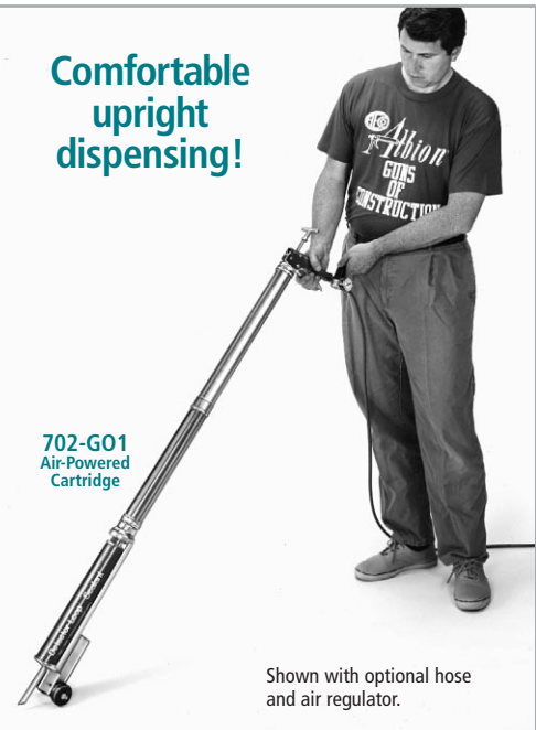
702-G01 Air-Powered Cartridge

Shown with optional hose and air regulator.