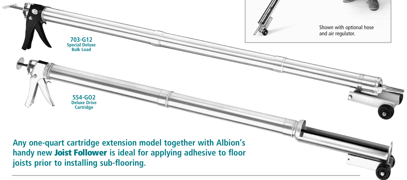
703-G12 Special Deluxe Bulk Load

Shown with optional hose and air regulator.