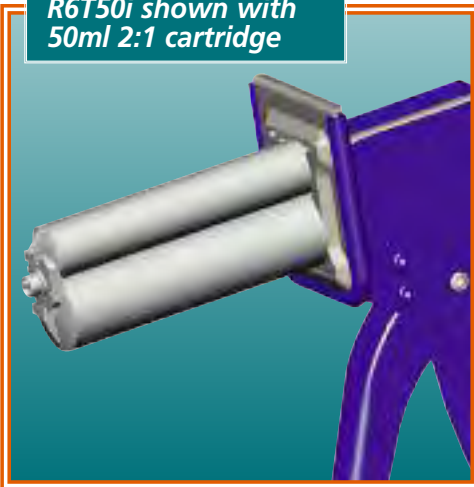
R6T50i shown with 50ml 2:1 cartridge

• 6:1 thrust ratio and ratchet drive — Makes dispensing material easier.