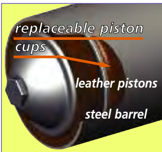
replaceable piston cups leather pistons steel barrel