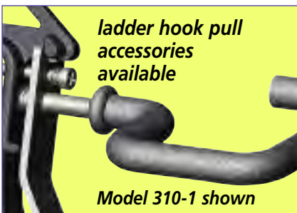
ladder hook pull accessories available