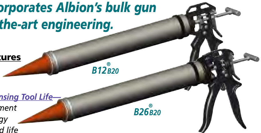
B12 ® B20

Don't settle for anything less than the best. For more information, visit us at our website at www.albioneng.com . Our full line of products come with an Albion warranty and our commitment to professional quality tools.