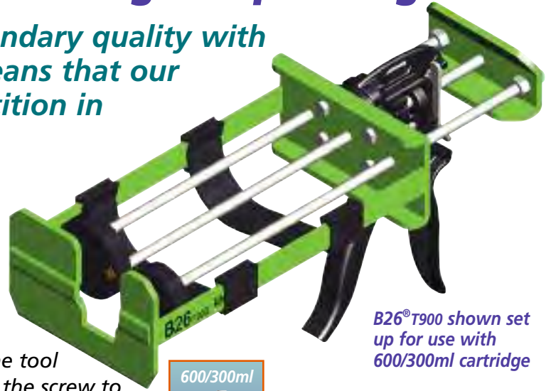
B26®T900 shown set up for use with 600/300ml cartridge

Don't settle for anything less than the best. For more information, visit us at our website at www.albioneng.com . Our full line of products come with an Albion warranty and our commitment to professional quality tools.