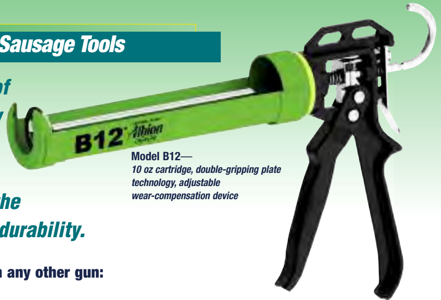
Model B12— 10 oz cartridge, double-gripping plate technology, adjustable wear-compensation device

The integration of Albion's legendary quality with state-of-the-art engineering means that our B-Line tools surpass the competition in value and durability.