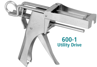
600-1 Utility Drive