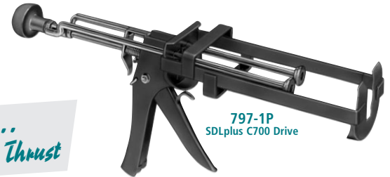
797-1P SDLplus C700 Drive