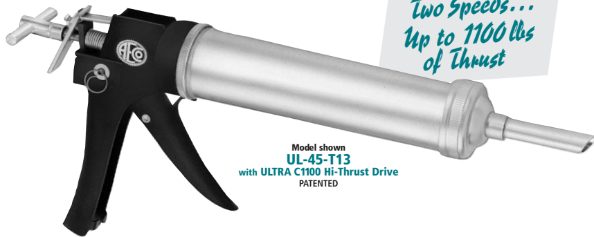
Model shown UL-45-T13 with ULTRA C1100 Hi-Thrust Drive PATENTED