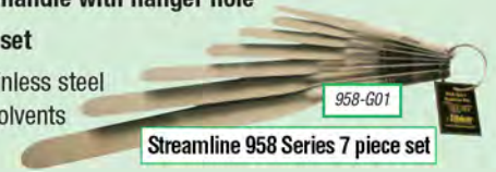
Streamline 958 Series 7 piece set