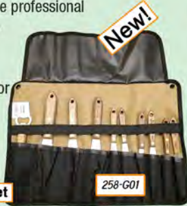
Classic 258 Series 9 piece set