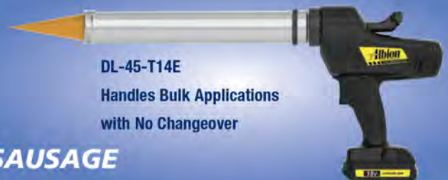
DL-45-T14E Handles Bulk Applications with No Changeover

Designed for sausage applications but can be used for bulk with no changeover • includes our Teflon (p/n 21-20) and hytrel (p/n 21-24) pistons • supplied with Albion's disposable orange plastic cones (p/n 235-3)