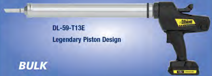
DL-59-T13E Legendary Piston Design

(For additional sizes go to our website at albioneng.com )